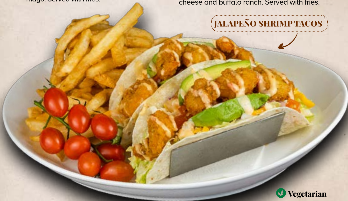
JALAPEÑO SHRIMP TACOS

Two flour tortillas with crispy cauliflower, lettuce, tomatoes, onions, avocado, Tex-Mex cheese and buffalo ranch. Served with fries.